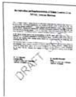
NPTEL and Syllabus Copy.JPG 65K