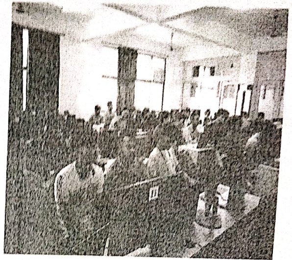
Students Attending VAP Session